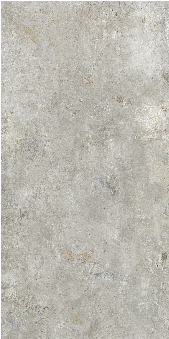
FIRE (Mottled Grey) Matte Finish

59.6 x 119.5 cm (24" x 48") BC.BD.FIR.2448