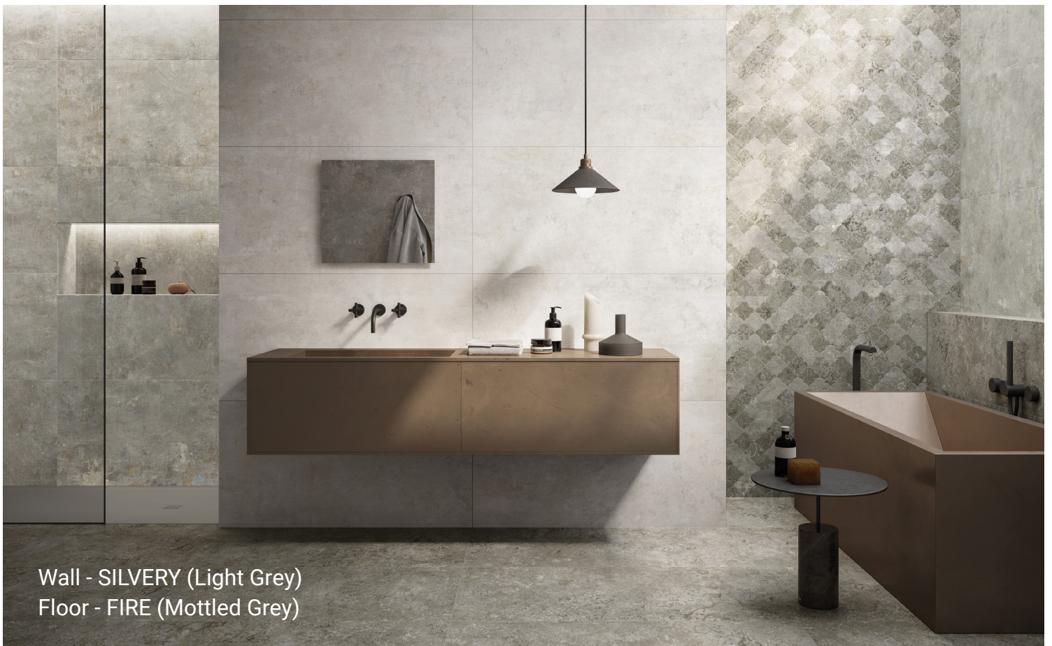
Wall - SILVERY (Light Grey) Floor - FIRE (Mottled Grey)