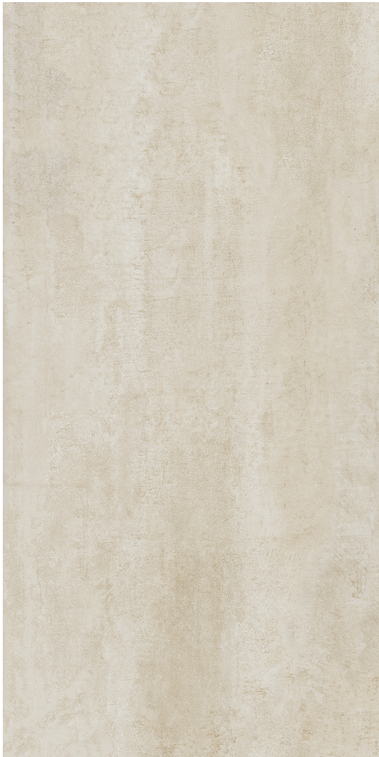
DYNAMIC (Beige) Matte Finish

59.6 x 119.5 cm (24" x 48") BC.BD.DYN.2448