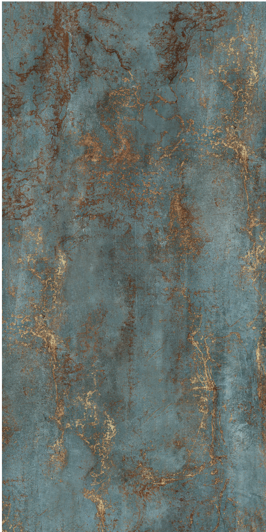
SUPREME (Blue/Gold) Matte Finish

59.6 x 119.5 cm (24" x 48") BC.BD.SPR.2448