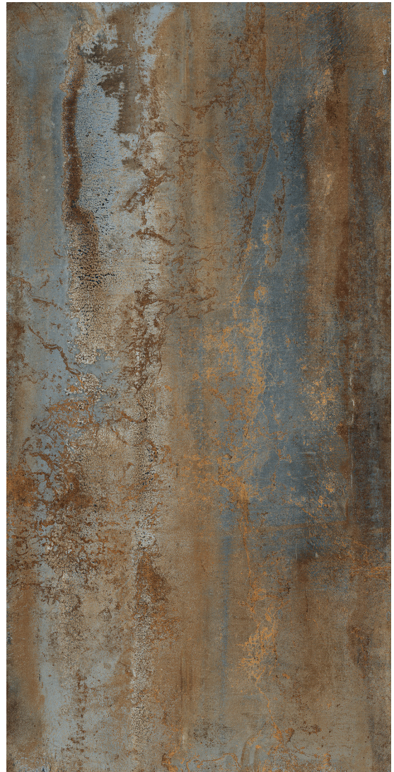
BEAT (Copper) Matte Finish

59.6 x 119.5 cm (24" x 48") BC.BD.FIR.2448