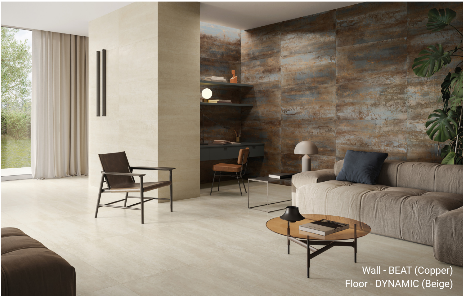
Wall - BEAT (Copper) Floor - DYNAMIC (Beige)