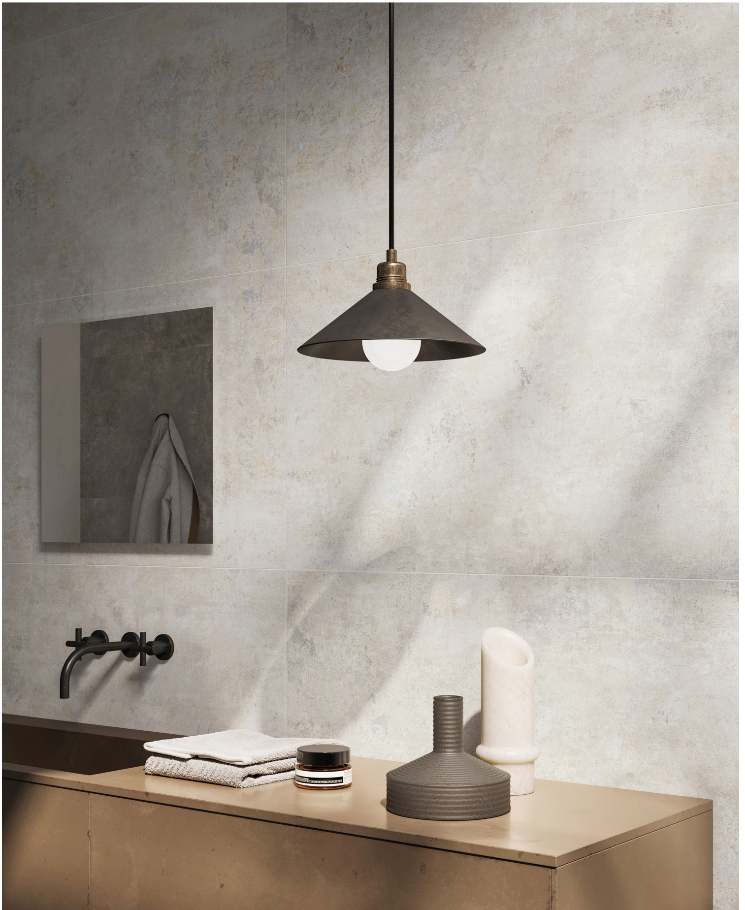
SILVERY (Light Grey)